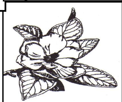
Sharing love through support

Steel Magnolias P.O. Box 2208 Anniston, AL 36202