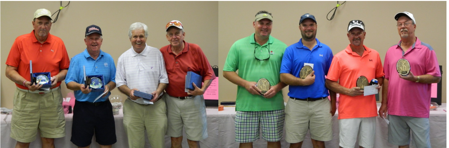
1st flight 1st place