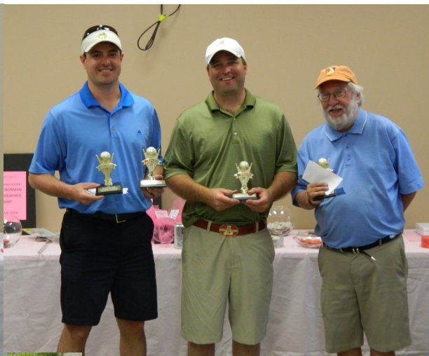
2nd flight 2nd place