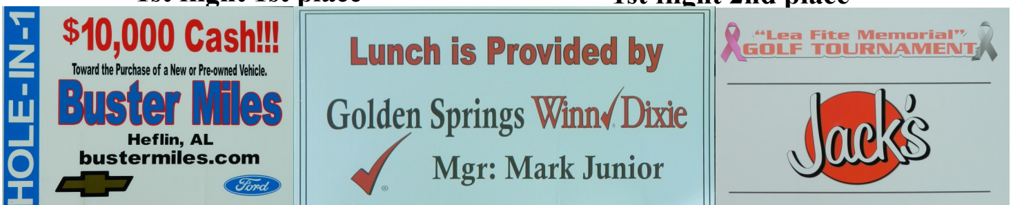
1st flight 2nd place