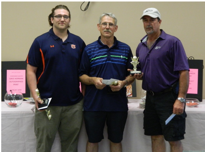
2nd flight 1st place